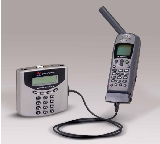
(satellite phone not included)

End-to-end voice and data security for digital communications